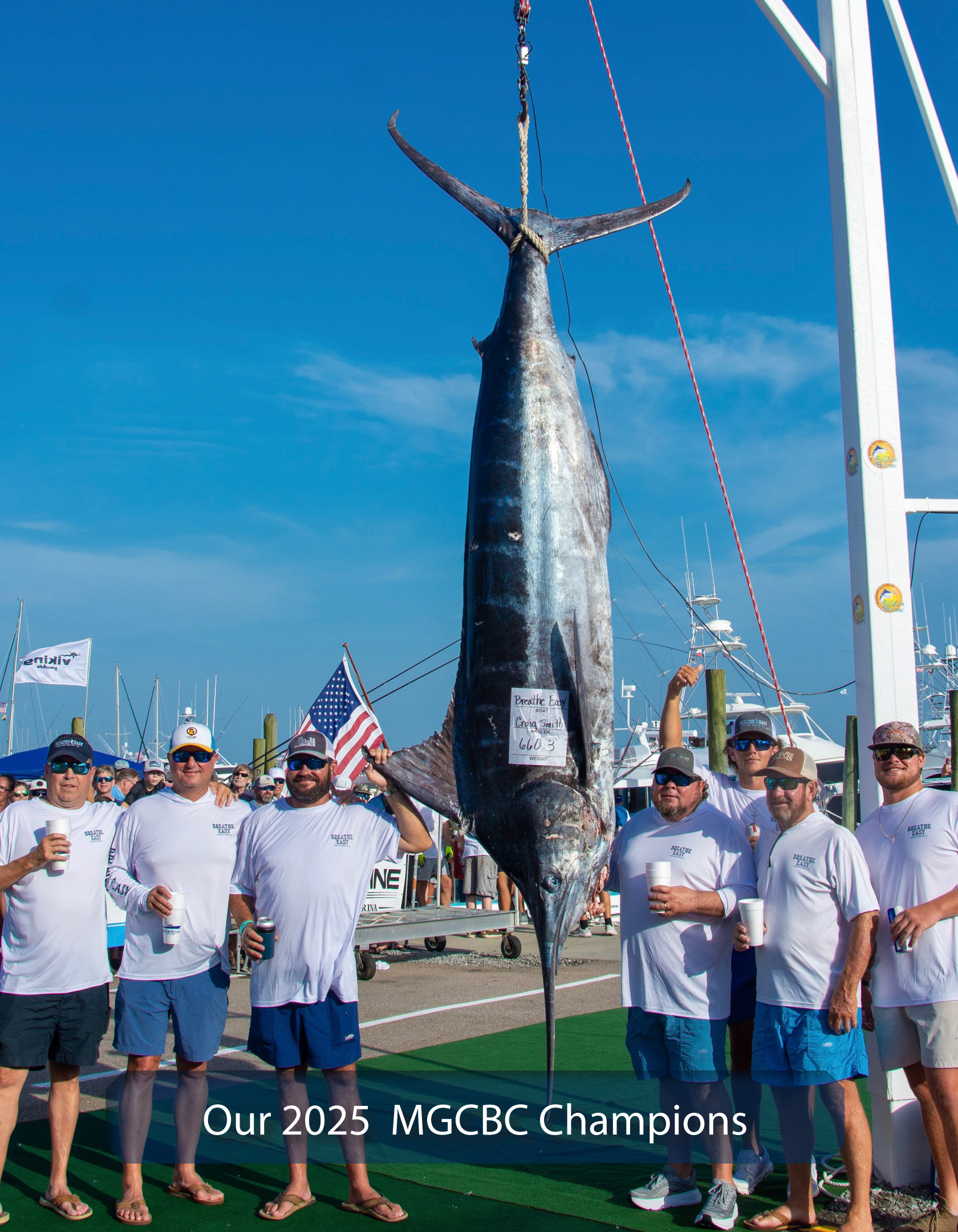
Our 2025 MGCBC Champions